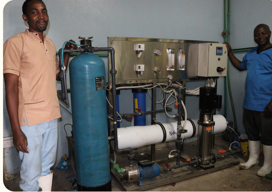
Reverse Osmsosis System