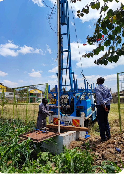
Secondary School Well