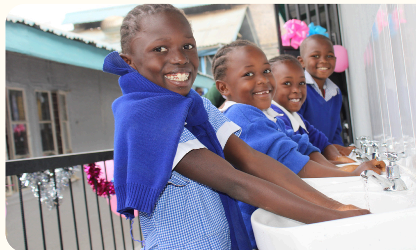
Primary School Sanitation Block